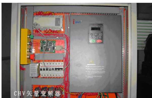
CHV vector inverter