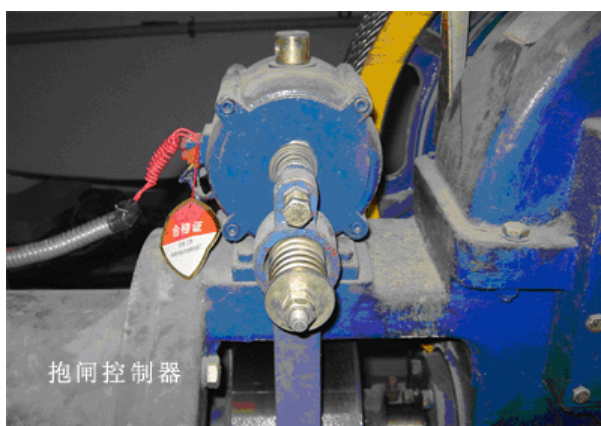
Band brake controller