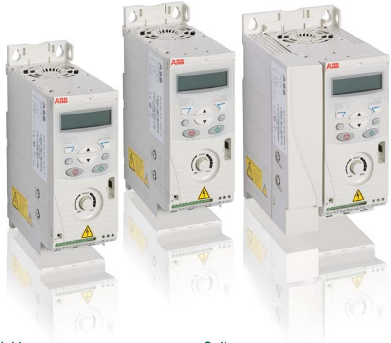
ABB component drives are designed to be incorporated into a wide variety of machines such as mixers, conveyors, fans or pumps or anywhere where a fixed speed motor needs to go variable speed motor.

The ACS150 drives have integrated user panel and potentiometer, and variety of features such as macros, which are pre-defined I/O configurations like 3-wire, PID-control and motor potentiometer macro. In addition, the drives offer extensive range of parameters that help obtaining the best performance out of the application.