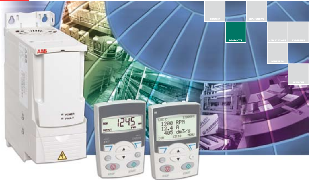
ABB general machinery drives

ABB general machinery drives are designed for machine building. In serial type manufacturing the consumed time per unit is critical. The drives are designed to be the fastest drives in terms of installation, setting parameters and commissioning. The basic products have been made as user-friendly as possible, yet providing high intelligence. The drives offer diverse functionality to cater for the most demanding needs.